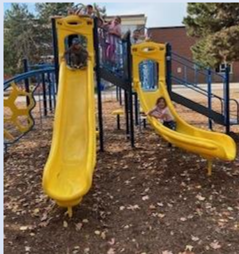
Loving our slides!

What a beautiful fall month we've been treated to. Our new play structure has finally been inspected and opened and our students have had a wonderful time exploring all it has to offer! HUGE thank you to our amazing School Council for working hard to raise the funds to upgrade the play experience of our students!