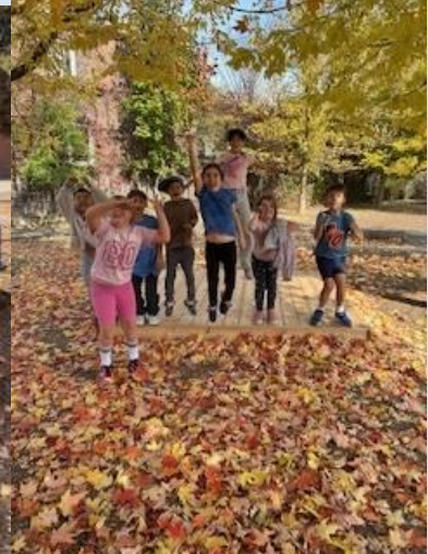
All the world's a stage!

Other field enhancements this month included the installation of our baseball backstop and our outdoor stages.