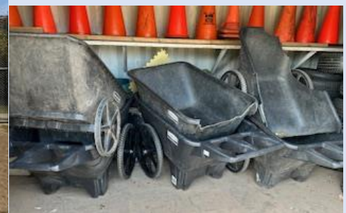
McMurrich <3 Wheelbarrows!